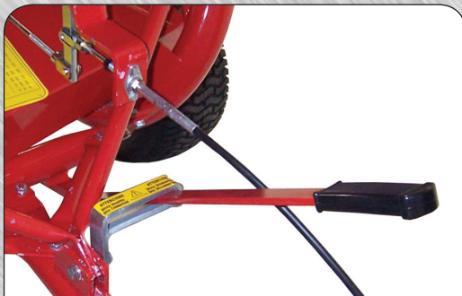
Gearbox lever to disengage drive for transport