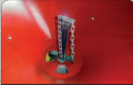
Optional chain agitator to prevent bridging of material